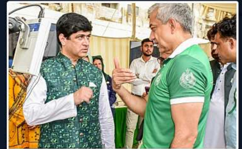
Transformation International Society celebrated World Disabilities Day With DEPD Government of Sindh on 3rd December, 2025