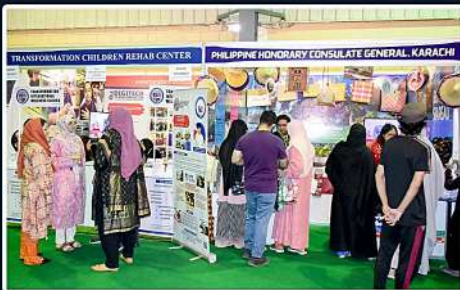
Transformation Children Rehab Center at My Karachi Expo We have delivered the following activities & Services: