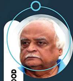
MR. ANWAR MAQSOOD

Pakistani Scriptwriter, TV Host, Satirist, Humorist, & Infrequent Actor, Artist