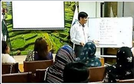
Transformation International Society in collaboration with Department Of Empowerment Of Person With Disabilities and Special Education Teachers Training Academy Sindh conducted an international training